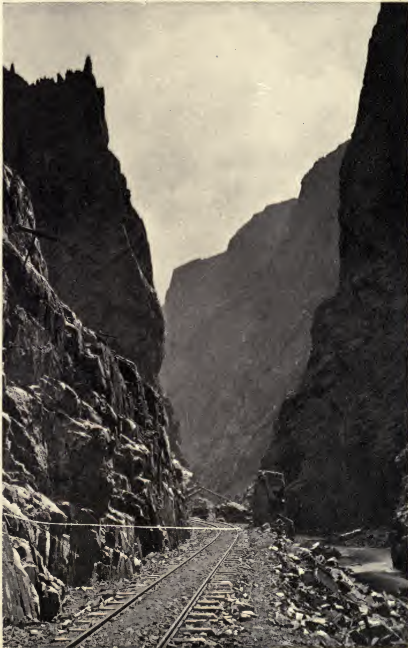
GRAND CANON OF THE ARKANSAS THE ROYAL GORGE